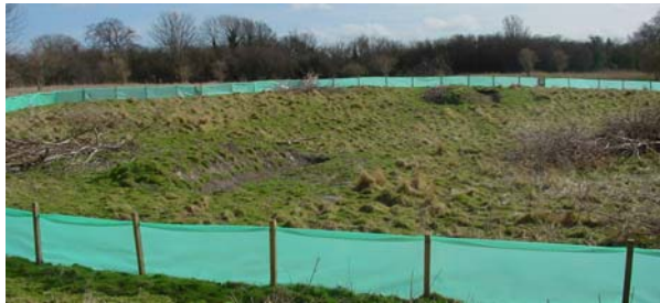
Protective measures in place to conserve a population of common lizards following their translocation within Melbourn.