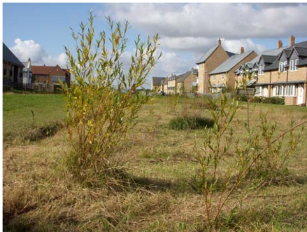
The creation of this osier greenway at Cambourne brings distinctive design, open space and biodiversity gain to the housing estate.