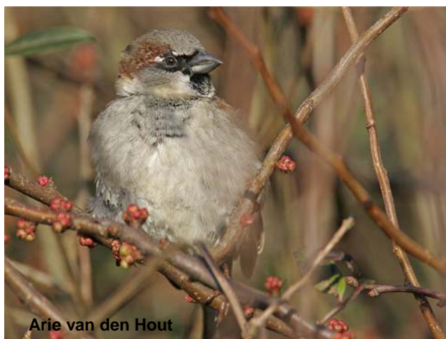
Arie van den Hout

Applicants are strongly advised to discuss all potential environmental issues at the earliest stage possible with the District Council.