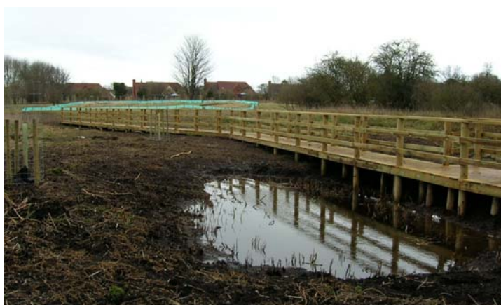
Stockbridge Meadows Riverside Park has been provided by Manor Kingdom Ltd for Melbourn Parish Council through a legal agreement attached to a planning decision.