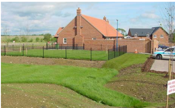
Housing at Lamb Drove, Cambourne, has successfully integrated SUDS adjacent to footpaths and open space. The wetland features provided habitats for amphibians and invertebrates.