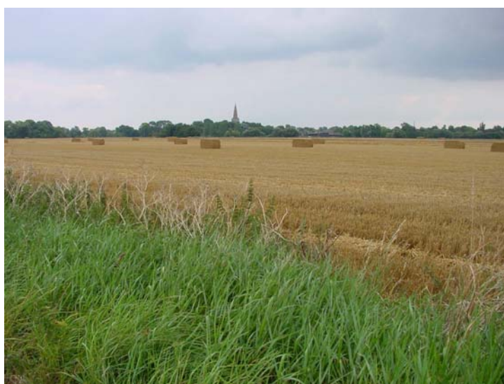
The Fens Natural Area looking towards Over.