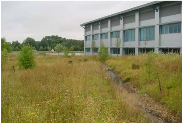
The use of ditches and wildflower meadows softens the impact of hi-tech office buildings at Granta Park.