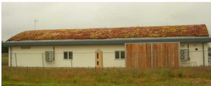
Orchard Park Community Centre