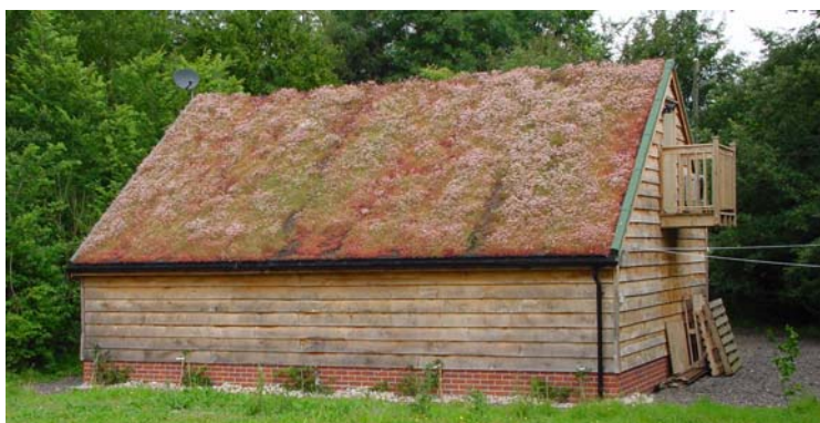
A private building using green roof techniques to lessen the visual impact.