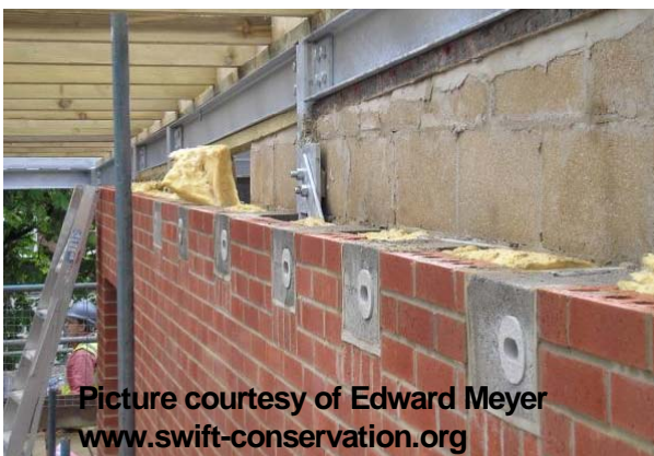
Many specialist nest and bat boxes can be purchased. These swift brick-boxes are being built-in to dwellings in New Barnet for the Notting Hill Housing Trust.