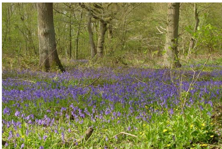
The West Anglian Plain Natural Area contains a number of ancient woodlands such as Hayley Wood.