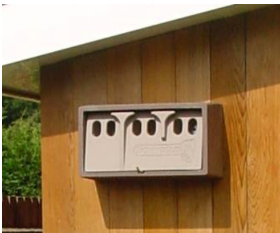
Bird boxes can be provided for house sparrows that attach to houses and garages (left) or they can be built-in to walls to provide for flycatchers, robins, or black birds (right). Climbing plants can be added for further cover.